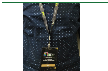
Lanyard & Badge