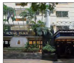
Royal Park Residence Hotel