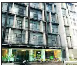
Grace 21 Hotel