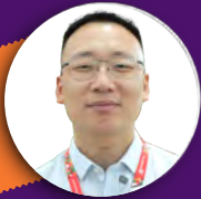
Yaoyuan Textile, China

We are into performance wear manufacturing of PSF polyester fiber and chips, polyester spun yarn, and polyester filament yarn. It has been the 2nd time we have been exhibiting in Intex. The experience is very good and getting more and more better. This time we have seen many good buyers and have built connections with business owners.